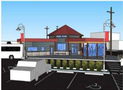
VIEW FROM PARKING LOT