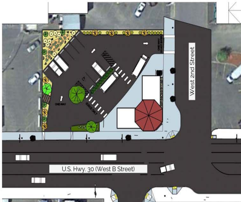
AERIAL SITE PLAN