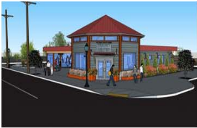
VIEW FROM INTERSECTION